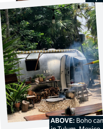
ABOVE: Boho camping in Tulum, Mexico.