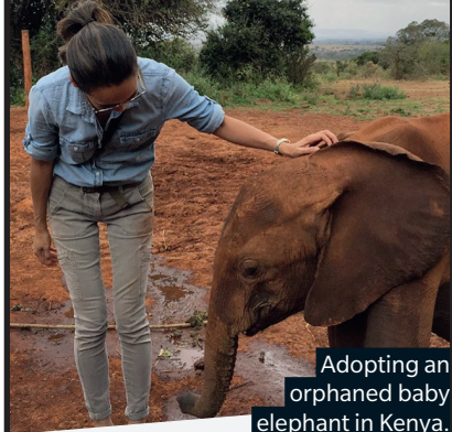
Adopting an orphaned baby elephant in Kenya.