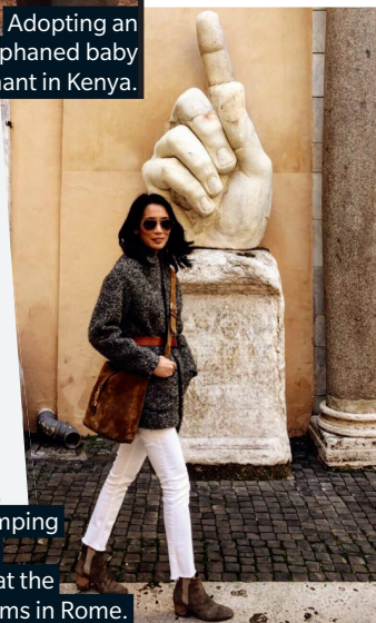
RIGHT: On point at the Capitoline Museums in Rome.