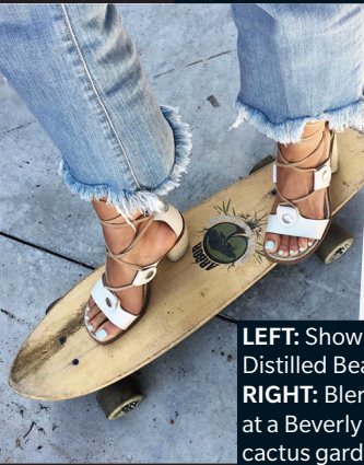
LEFT: Showing off a Distilled Beauty Bar pedi. RIGHT: Blending in at a Beverly Hills cactus garden.